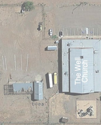
The Well Church

From 260 N (Zane Grey Hwy) and 87 N, 63.0mi to Airport Road and destination on the left.